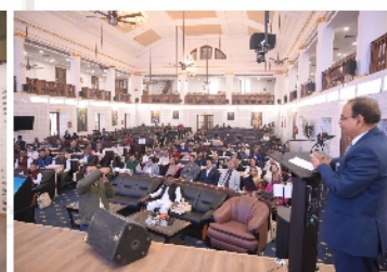
Senate Meeting February 01, 2025